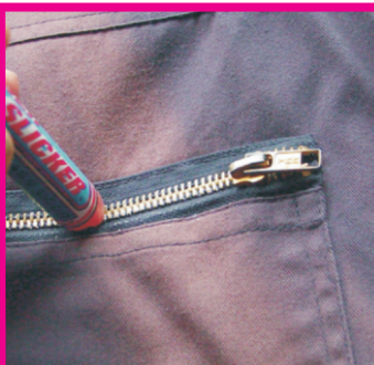
Boat & RV Zippers