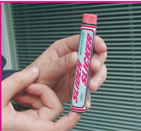
Press the stick up to expose