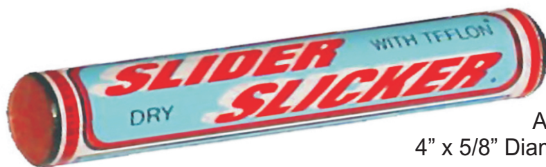
Actual Size. 4" x 5/8" Diameter Stick, 17 Grams.