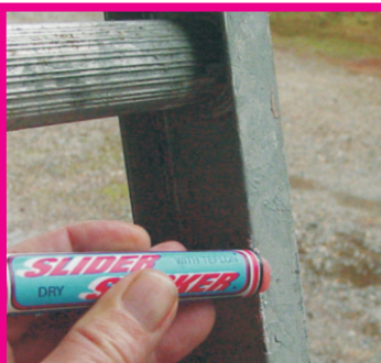
Binding Extension Ladders