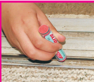
Door & Window Tracks