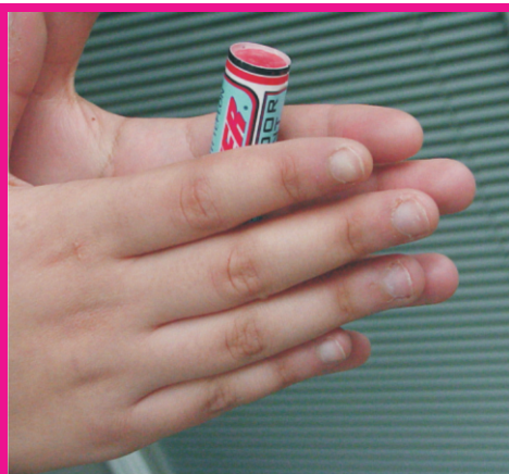
Gently roll to loosen the tube

Slider Slicker is a registered trademark of Cross Devices, US Pat. and T.M. off.