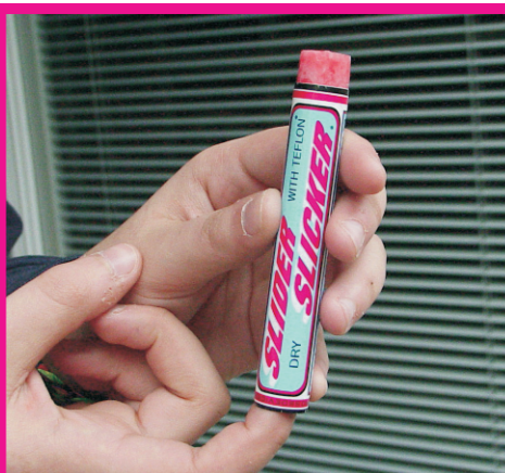
Press the stick up to expose