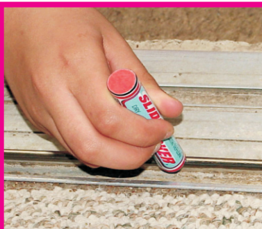
Door & Window Tracks