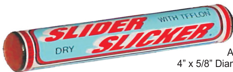
Actual Size. 4" x 5/8" Diameter Stick, 17 Grams.