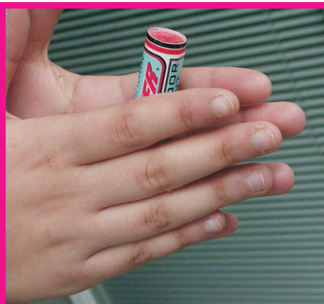
Gently roll to loosen the tube

Slider Slicker is a registered trademark of Cross Devices, US Pat. and T.M. off.